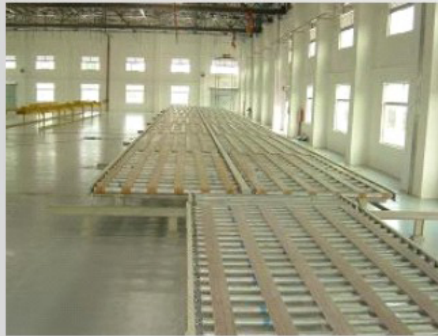
2 Lanes 1 Layer