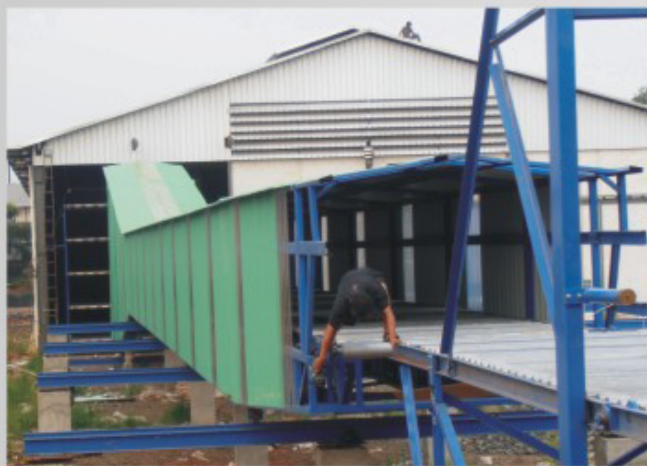
Moving Gantry & Racks