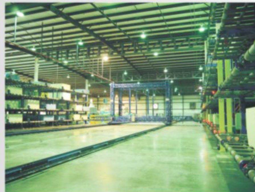
Both Side Multiple Lanes 4 Layers & Moving Gantry