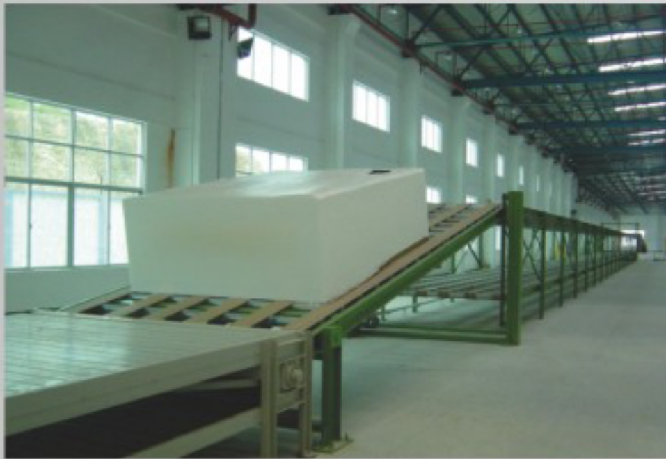
1 Lanes 2 Layers