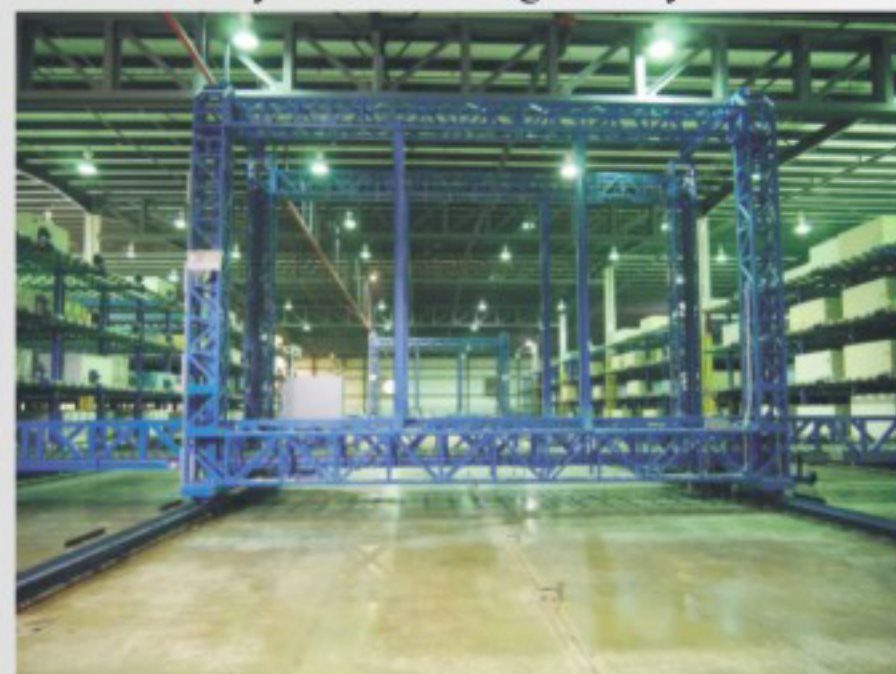
Both Side Multiple Lanes 4 Layers & Moving Gantry