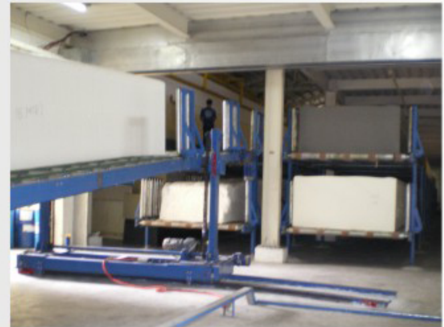
2 Lanes 2 Layers